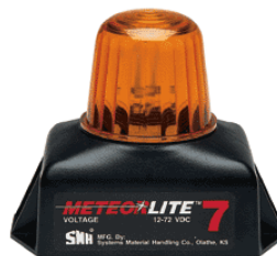
Low Profile Amber Strobe Light

ANSI/ITSDF B56.1-2005 - Safety Standard for Low Lift and High Lift Trucks.