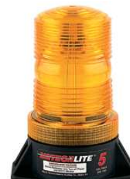
Amber Strobe Light